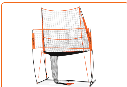
Front Net is height adjustable from ladies regulation 7'4" (right) to men's regulation 7'11.6" (above)