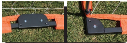
Heavy-duty steel base gives Bownet Goals its stability and strength.