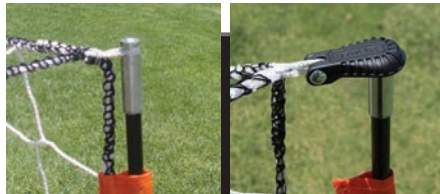
Extremely durable nylon netting for maximum flexibility and strength.

3'x5', 4'x6' and 4'x8' goals use Bownet's Quick Clip® (Above right) for simple and safe set-up.